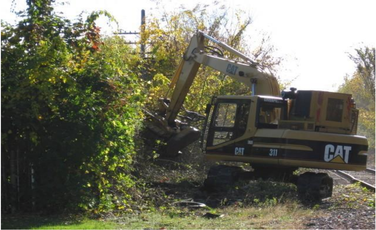
Figure 5: Mowing and Brush Cutters

Off Track Mowers can quickly clear vegetation obstructing visibility at road / rail crossings. However, mechanized mowers and cutters are non-selective tools and as a result the ability to discriminate between desirable and undesirable species is limited.