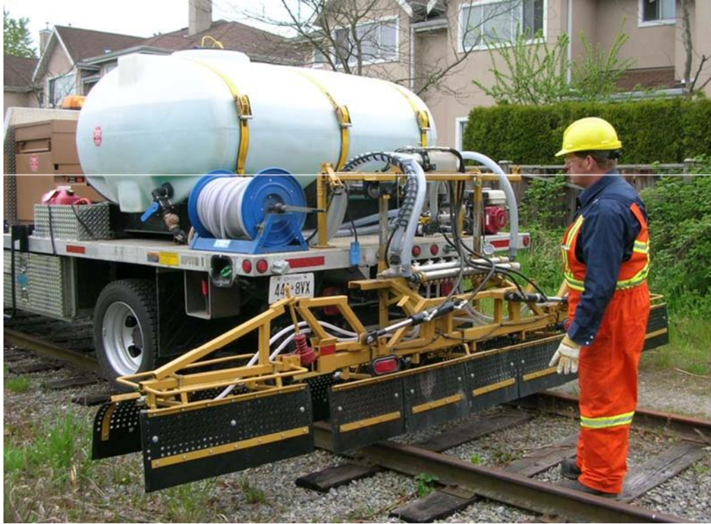
Figure 8: Shrouded Boom Sprayer

accommodate variations in treatment condition. The shrouded boom allows for the application of herbicide over a set width (e.g., the width of the ballast plus the shoulder). Shrouded booms are mounted on a Hi Rail vehicle with a power-driven pump to apply herbicide.